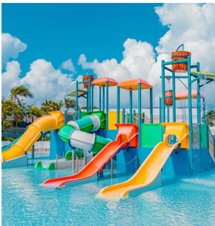
ACTIVITIES FOR ALL AGES