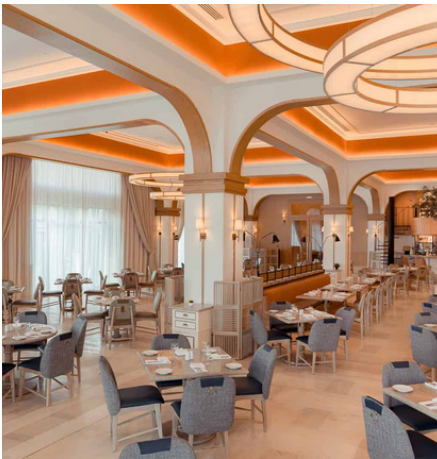
FINE & CASUAL DINING

At the Hard Rock Hotel Punta Cana, all-inclusive means: luxury amenities, 5-star accommodations, 24-hour room service, fine dining, and the best Caribbean fare the Dominican Republic has to offer, free Wi-Fi, in-room double hydrosपा tubs, unlimited phone calls, endless activities for kids, thirteen pools, daily and nightly live entertainment, unparalleled service, and much more.