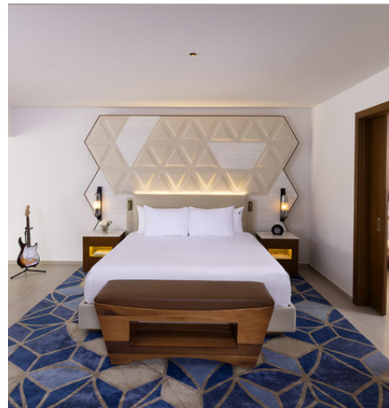
5 STAR ACCOMADATIONS